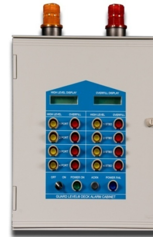
Guard Level Deck Alarm Cabinet with solar panel